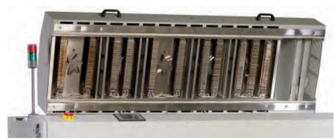
Plenum convection heating provides uniform temperature profiling across the entire PCB board.