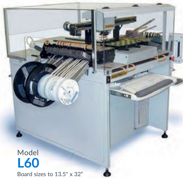
Model L60 Board sizes to 13.5" x 32" & 96 feeder positions