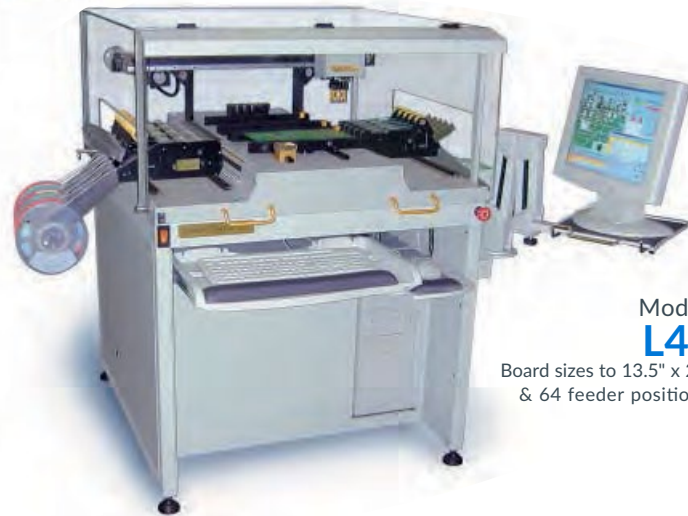
Model L40 Board sizes to 13.5" x 22" & 64 feeder positions